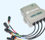
YM-2 Controller Reliable data coordination