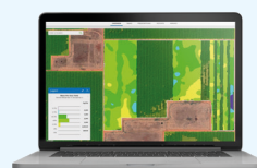
Topcon Agriculture Platform (TAP) An intuitive farm management ecosystem that automates data collection, visualizes yield performance, and simplifies reporting