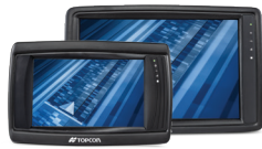
XD (7") or XD+ (12.1")