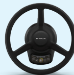
XW-1 Electric Steering Wheel