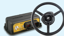
ACU-1 Steer Ready Interface AES-35 Electric Steering Wheel