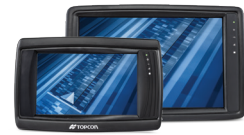
XD (7") or XD+ (12.1")