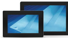
XC1 (7") or XC1 plus (10")