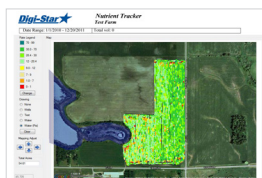
Application Rate Map