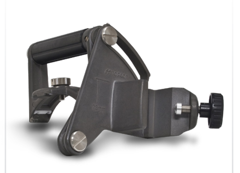
Trivet Handle for TP-L5 / L6 Trivet Stand