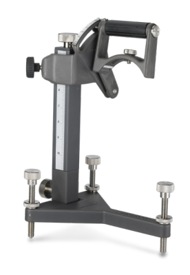
Trivet Stand with Adjustable Pole Trivet Stand