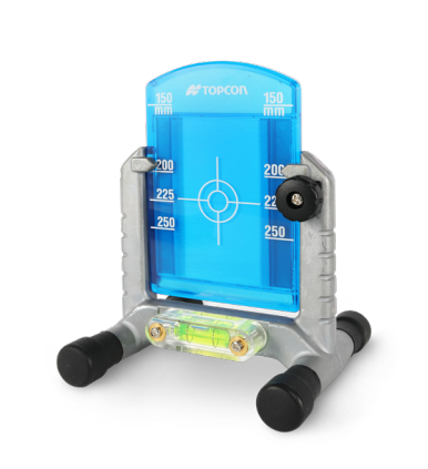
Adjustable Target Kit TP-L5 / L6