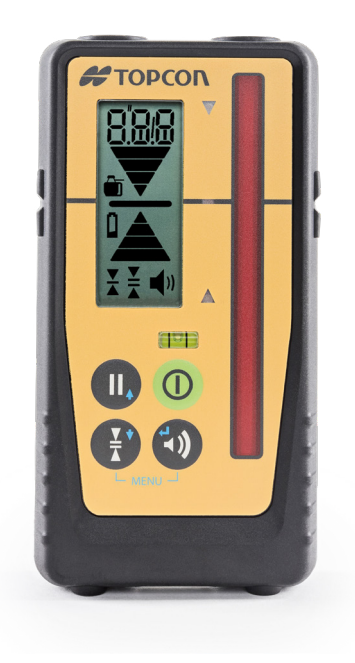
LS-100D Display readout on front and back.

LS-80X Display readout on front and back.